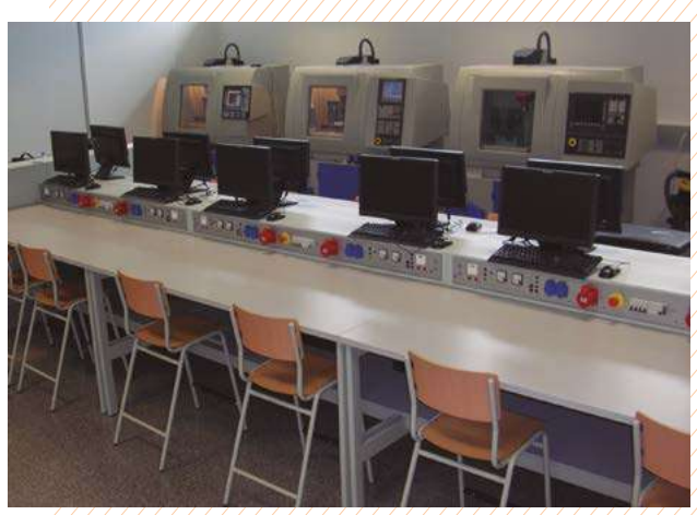
Numeric Control Laboratory. Metal Business Federation. MURCIA