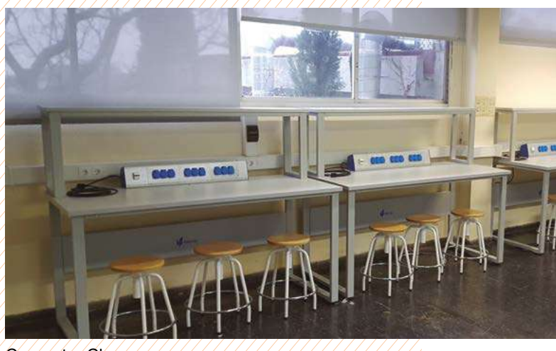
Computer Classroom. CIFO LA VIOLETA – CATALONIA