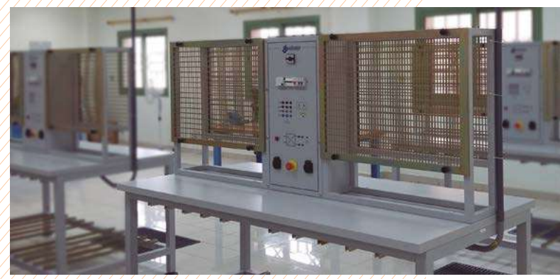
Electrical Installation Laboratory. COE MUHAYIL – ARABIA SAUDI