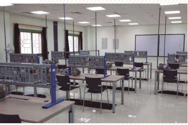
Electrical Automation Classroom. COE ASIR – ARABIA SAUDI